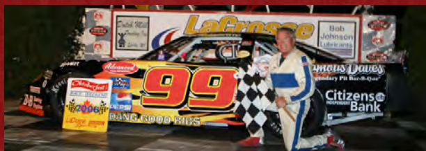
Trickle's last start in the Oktoberfest 100 -Main Event - Was October 7, 2007. He Finished 7th.

FORMAT: Fastest 15 in Qualifying advance to 99 Lap Feature. 10-Lap Last Chance(s) If two last chances, top three advance. If Three Last Chances, top two advance. FEATURE RACE: Is Run in (3) 33-Lap Segments. 1st is lined up straight from Qualifying. 2nd is lined up by inverting 10 plus draw of the first segment (must be on lead lap). 3rd is lined up by inverting 10 plus draw of current points (must be on lead lap)! OVERALL LOWEST SCORE IS THE CHAMPION!