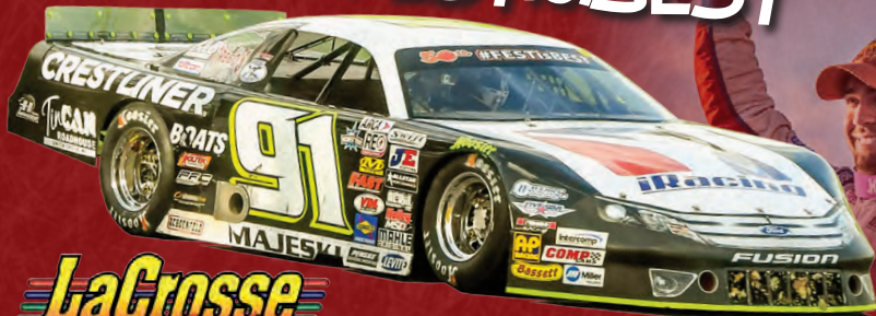
2019 Champion Ty Majeski