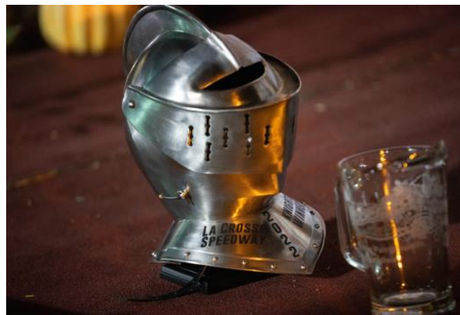
KNIGHT'S OF OKTOBERFEST WINNER'S TROPHY